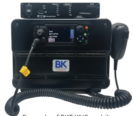
Example of BKT KNG mobile connected to JPS RSP-Z2 gateway

The donor radio needs to be programmed to operate on the conventional channel or trunked system talkgroup you wish to connect to InteropONE™, as well as configured to operate with your RoIP gateway. JPS provides donor radio interface cables for nearly every model of LMR radio.